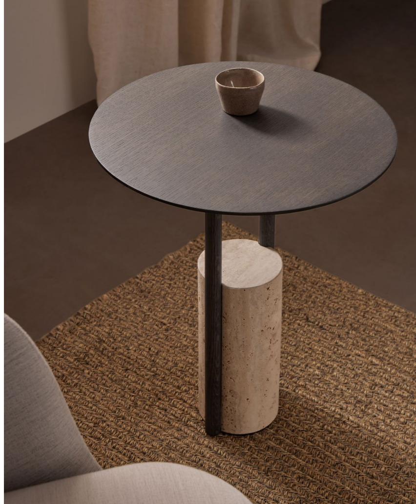
Over these lines, Zanco in ash oak and travertine marble. On the right, Zanco in natural oak and travertine marble.

Zanco is an occasional table generated by simple geometries that enhance the value of its materials. The circular top is supported by two cylindrical columns which are inserted on both sides of a cylindrical marble base. The purity of shapes and nobility of materials grant this table elegance and versatility.