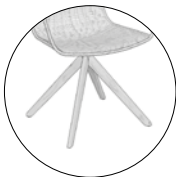
oiled sapele wood pyramid-shaped base