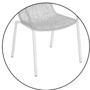
stainless steel tube