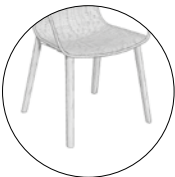
oiled sapele wood classic 4-legged