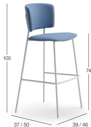
WRAP STEEL 6C73