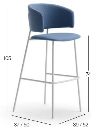
WRAP STEEL 6C72