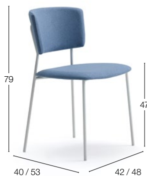
WRAP STEEL 6C71