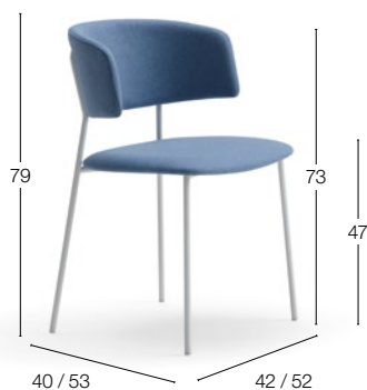
WRAP STEEL 6C70