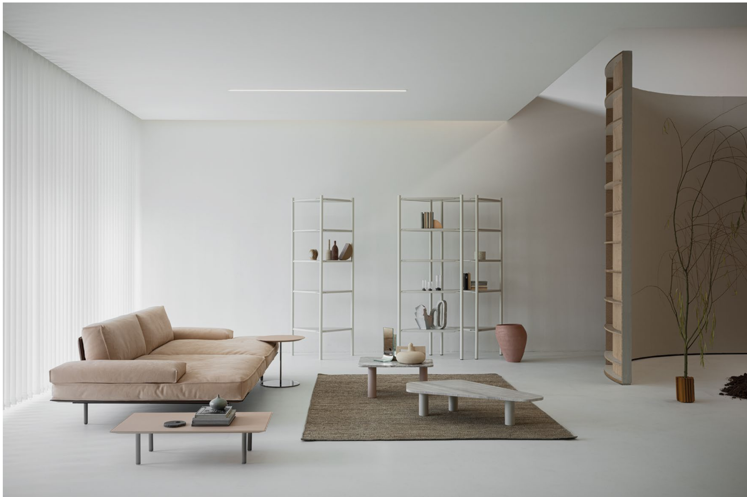
Vogue cuoio sofa el. XG in leather Nabuk 55, frame in Setanil 76, black chromed legs. Vogue cuoio coffee tables TR rectangular and TT round in leather So to 55, black chromed legs.