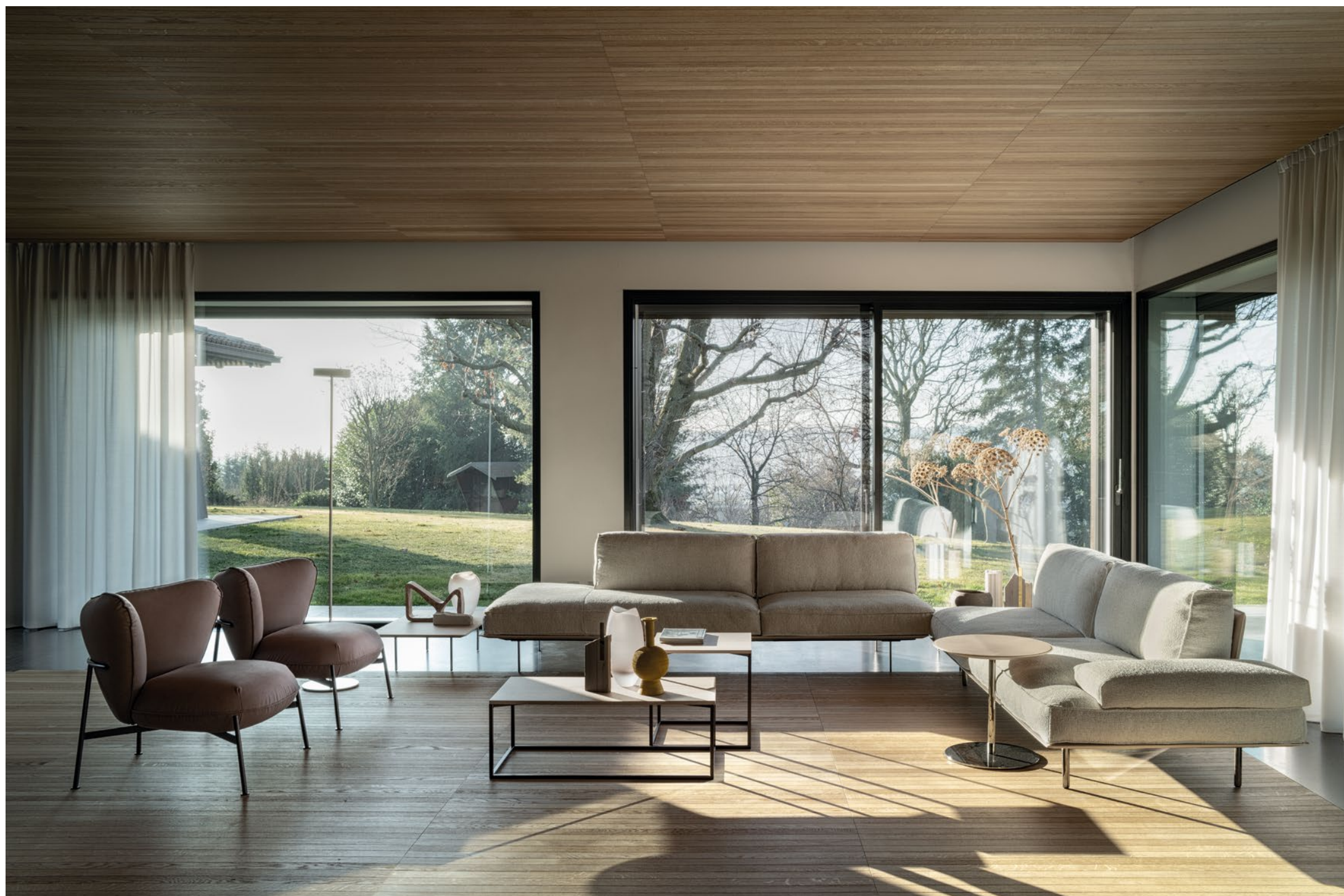
Vogue cuoio sectional el. 30+TQ+77+TR frame in leather Soffio 55, cushions in fabric Lucinasco 20, black chromed legs. Vogue cuoio coffee tables TR rectangular and TT round in leather Soffio 55, black chromed legs. Gina armchair el. 1SB in leather Setanii 42, matt lacquered metal frame RAL 3007.