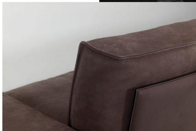
Vogue cuoio sofa el. X frame in leather Setanil 42, cushions in leather Nabuk 42, black chromed legs.