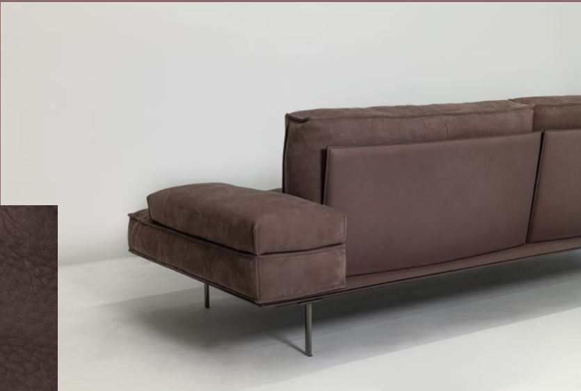
Vogue sofa el. SX in leather Nabuk 98, black chromed legs.