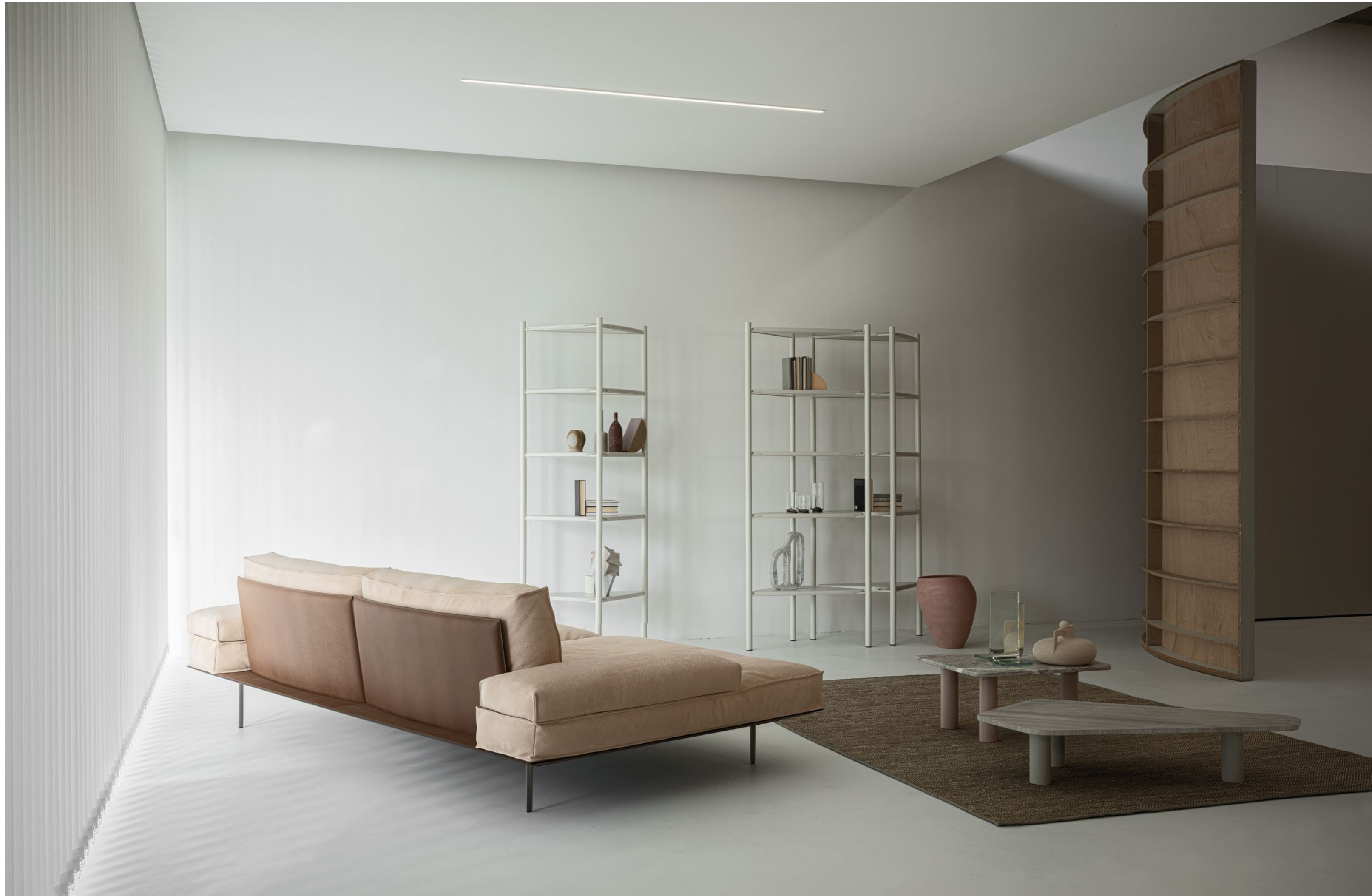
Vogue cuoio sofa el. XG in leather Nabuk 55, frame in Setanil 76, black chromed legs.