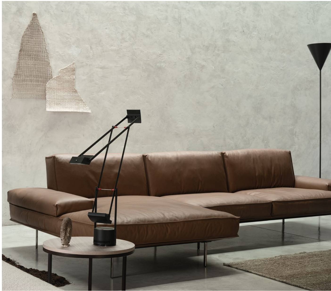
Vogue sectional el. 20+17 in leather Setanil 76, black chromed legs.