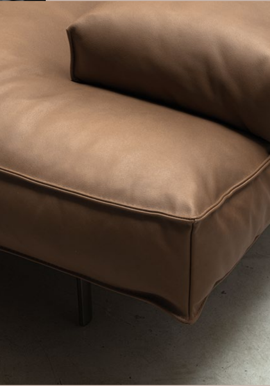
Vogue sectional el. 20+17 in leather Setanil 76, black chromed legs.