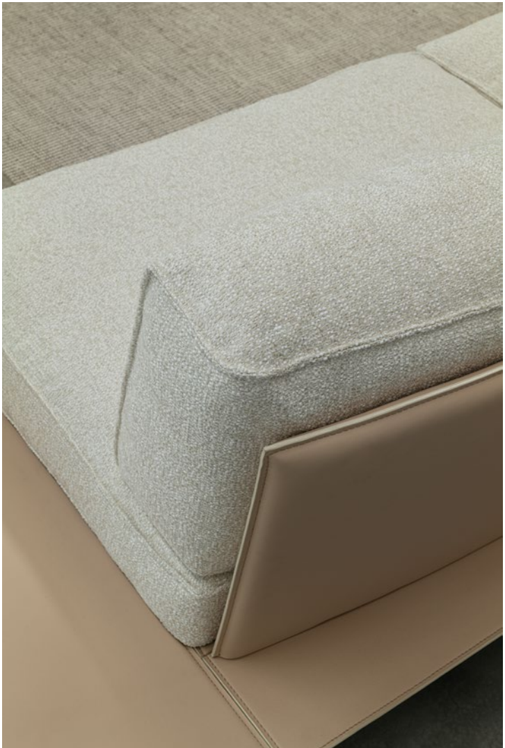
Vogue cuoio sectional el. 30+TQ+77+TR in fabric Lucinasco 20, frame in leather Soffio 55, black chromed legs. Vogue cuoio coffee table TT round in leather Soffio 55, black chromed legs.