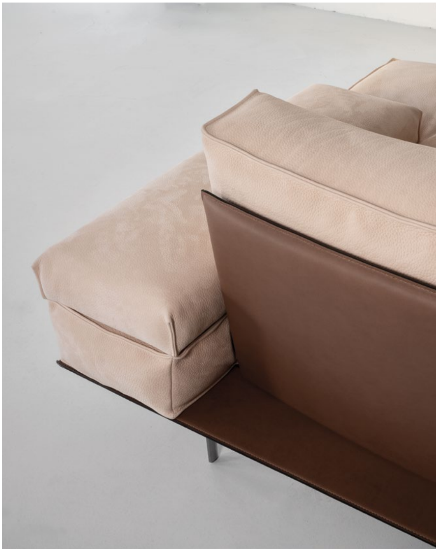
Vogue cuoio sofa el. XG in leather Nabuk 55, frame in Setanil 76, black chromed legs.

Modular sofa with a metal frame supported by elastic belts. Seat cushion and backrest padded with expanded polyurethane foam, covered with siliconized microfiber. Wooden armrest frame padded with polyurethane foam covered with siliconized microfiber. Sofa basement and backrest frame with special finishing raw cut edges, can only be made in leather Setanil or Soffio.