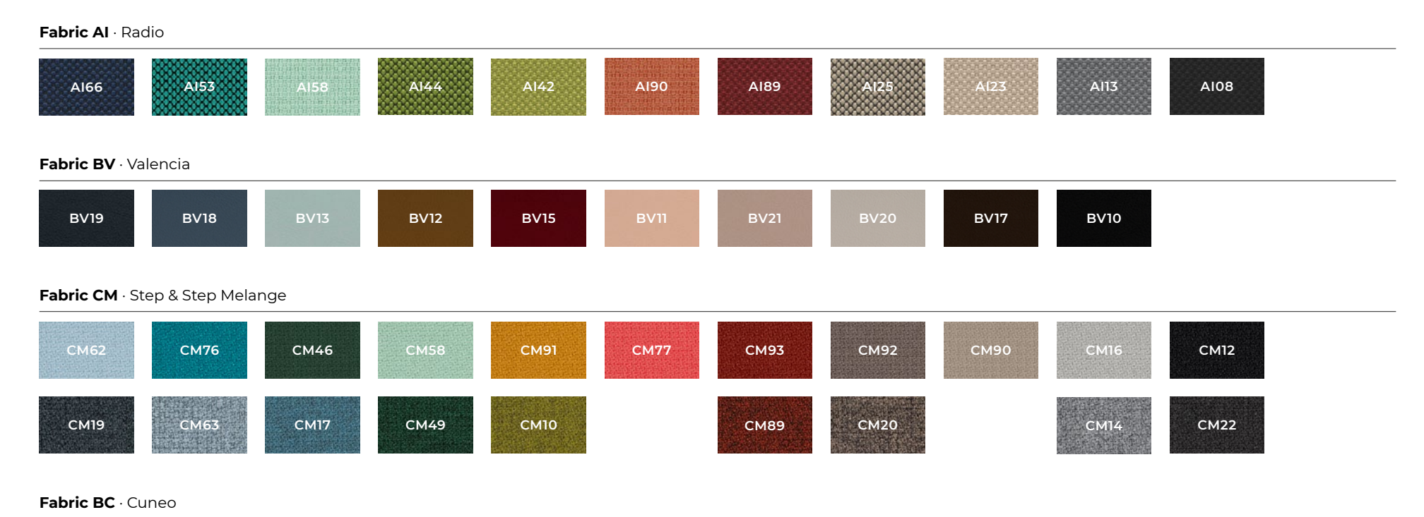
\textbf{Upholstered} \boldsymbol{\cdot} \textbf{Single-colour combination}