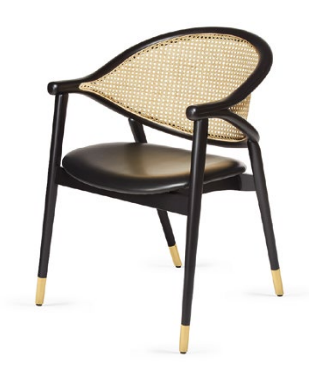
umami P cane deluxe