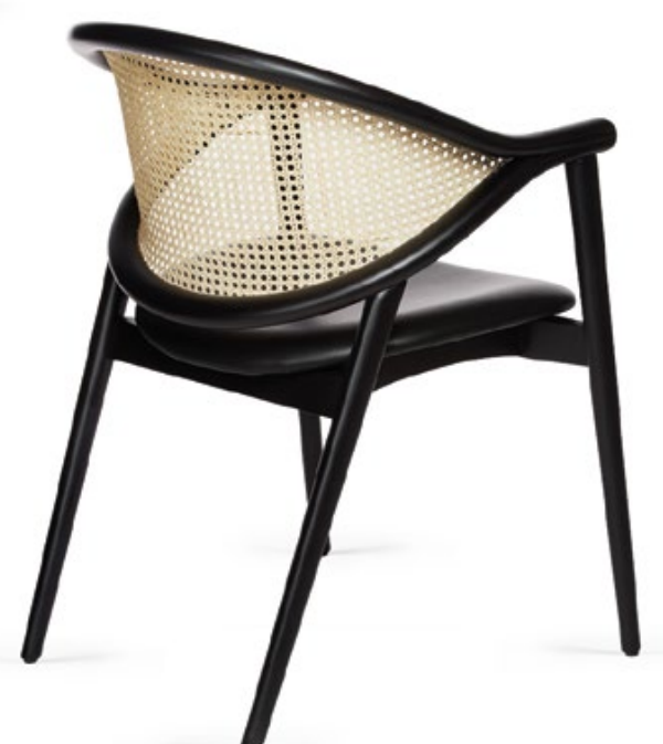
umami P cane