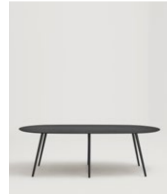
TG6 Aluminium legs are available in polished or powder coated. Oval top