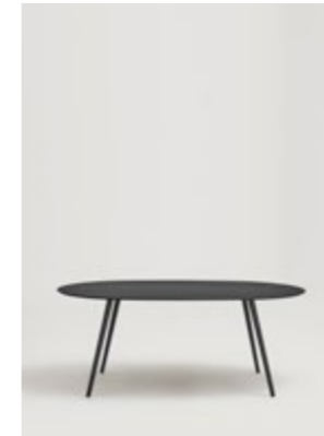
TG4 Aluminium legs are available in polished or powder coated. Oval top