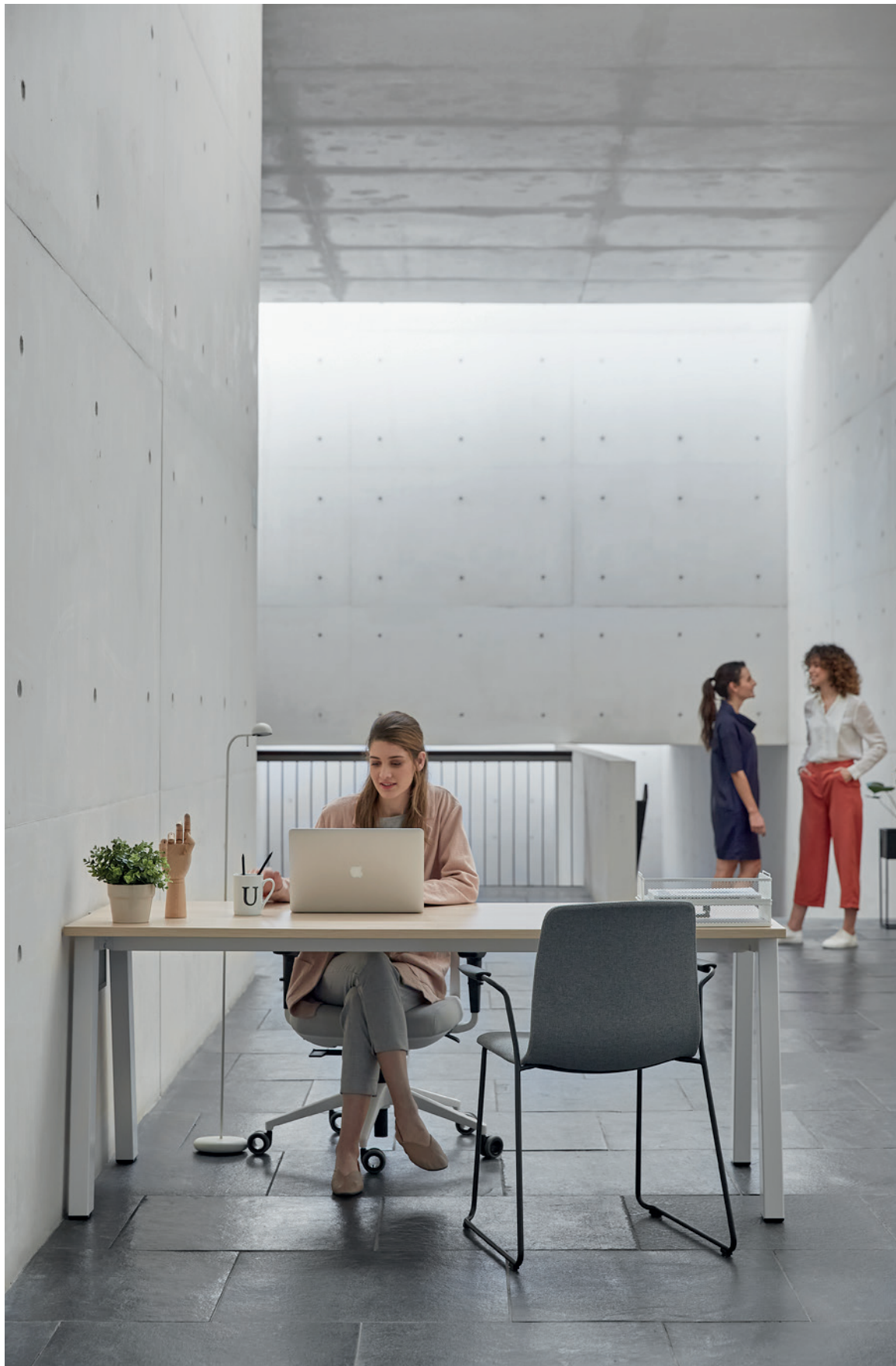
VITAL PLUS 300

It's time to clear your mind and prepare for new challenges. The Vital Plus 300 tables support all the projects put on the table. The warmth of the wood and its contrast with the metal legs provide any space with a simple and modern touch. The different shapes with pyramid legs give off a very cozy feeling.