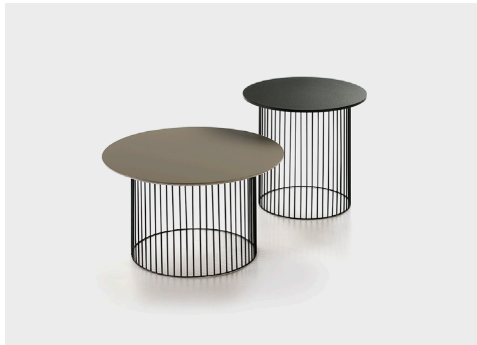
IDRA-45R Ø55x52 cm IDRA-74R Ø70x40 cm

Idra table can have micro-textured black or white thermo-lacquered metal structure, that's what provides versatility to adapt it in every kind of space.