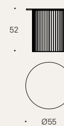
IDRA-55R Ø55x52 cm 0,202 m 3 12 Kg