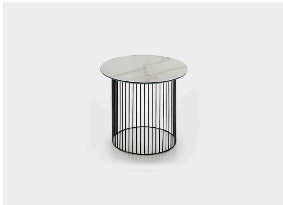
IDRA-45R Ø55x52 cm