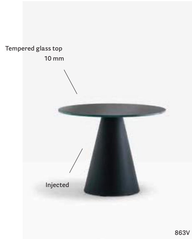
TABLE / TAVOLO