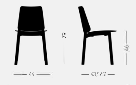
Billa 1C52 4,10 kg 0.34 m 2 pz Steel Chair, wood seat and backrest.