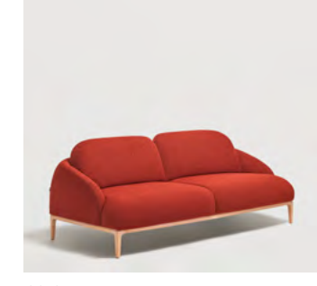
Upholstered one seat sofa with beech wood base